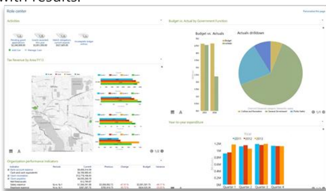
Role Centers provide customized information to users

Empower workers with secure real-time access to the information they need. Tailored Role Centers, e.g. Budget Manager and Treasurer, provide individuals with a personalized experience that presents the information, tools and tasks relevant to their roles, allowing them to access and find what they need, rather than calling on specialists for information. Users can prioritize tasks, take advantage of intuitive navigation and report generation, and connect key business processes with results.